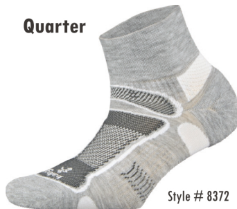
Style # 8372