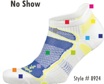
Style # 8924